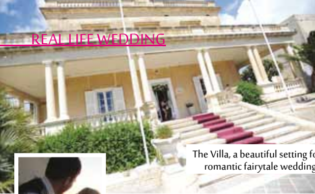
The Villa, a beautiful setting for a romantic fairytale wedding