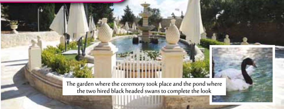
The garden where the ceremony took place and the pond where the two hired black headed swans to complete the look