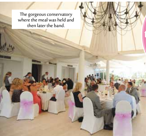
The gorgeous conservatory where the meal was held and then later the band.

"Our Wedding Planner Sarah Young ensured the venue was set up to perfection and co-ordinated the whole day."