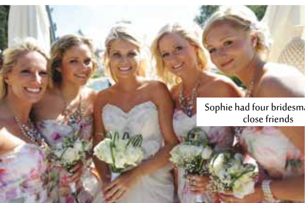
Sophie had four bridesmaids all close friends